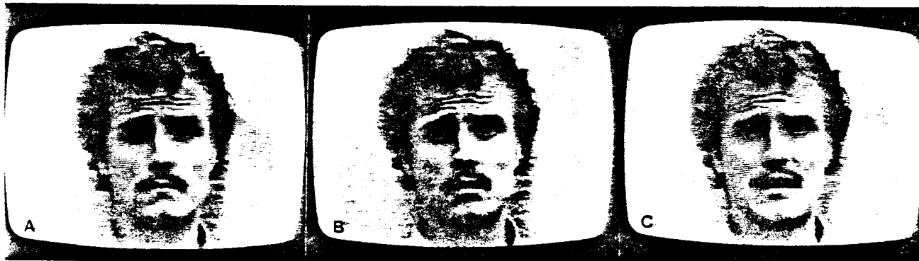
Fig. 1. Frames from the videotape of one of the actor's performance of the fear prototype instructions: (A) "raise your brows and pull them together." (B) "now raise your upper eyelids." (C) "now also stretch your lips horizontally, back toward your ears."

We studied six target emotions (surprise, disgust, sadness, anger, fear, and happiness) elicited by two tasks (directed facial action and relived emotion), with emotion ordering counterbalanced within tasks. During both tasks, facial behavior was recorded on videotape, and second-by-second averages were obtained for five physiological measures: (i) heart rate—measured with bipolar chest leads with Redux paste; (ii) left- and (iii) right-hand temperatures—measured with thermistors taped to the palmar surface of the first phalanges of the middle finger of each hand; (iv) skin resistance—measured with Ag-AgCl electrodes with Beckman paste attached to the palmar surface of the middle phalanges of the first and third fingers of the nondominant hand; and (v) forearm flexor muscle tension—measured with Ag-